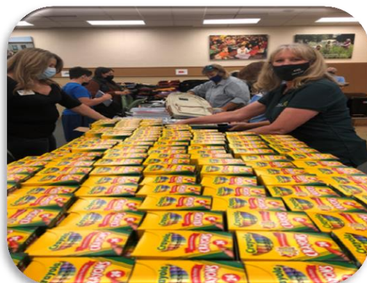
Rotary Club members assembled backpacks with new school supplies for students in need

UWMC administers the annual Stuff the Bus program in partnership with Monterey County Office of Education (MCOE). The program ensures that students start school with the tools they need to learn, and it helps ease the burden of additional costs for families. Before the academic year starts, backpacks containing the new school supplies are being delivered to students by Homeless Liaisons in over 20 school districts. 2020 school data indicates there are over 10,000 local students experiencing homelessness.